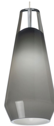
Shown in satin nickel / smoke