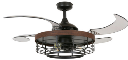
Shown in black / koa / smoke

LAMP COLOR . . . . . 2700K LUMENS/WATT . . . . . 240.00 LUMINOUS FLUX . . . . . 1080 lumens