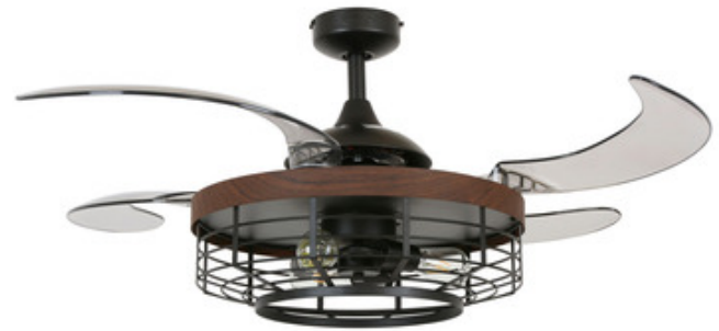
Shown in: Black / Koa / Smoke

The Fanaway Montclair Retractable Ceiling Fan is an advanced ceiling fan with unique aesthetics and design. Switched off, the traditionally intrusive fan blades automatically retract and conceal, transforming the unit into a modern industrial pendant. Turning the fan on creates a centrifugal force deploying the blades to circulate air in the room. Includes three dimmable LED bulbs, a 5 inch downrod, a 3-speed remote control and wall mount, and winter/summer mode (manual switch). Optional downrod lengths sold separately.