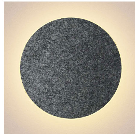
Shown in charcoal felt

The Ramen Wall Sconce, designed by Kenneth and Edmund Ng, features magnetically attached face plates which are interchangeable - available in Charcoal Felt, Matte White, Matte Black, Chrome, Brass, Brushed Nickel, White Oak or Oiled Walnut veneer, or Paintable (primed white). Available in two sizes. The bowl-shaped body emits 360 degrees of diffused light. Magnet for removing face plate included. The Charcoal Felt, Oiled Walnut and White Oak face plates are suitable for use in indoor or covered outdoor spaces. The other face plate finishes can be used indoors or in any outdoor space.