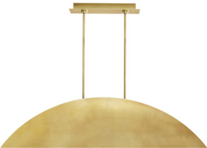
Shown in: Natural Brass

Inspired by the Bauhaus movement, the generously sized Bau Linear Pendant is an eye-catching geometric statement piece made of two arc-shaped stamped metal plates. Integrated LEDs shine out from between the plates, providing ample indirect illumination. Dimmable with a TRIAC or ELV dimmer. The Natural Brass is a living finish that will patina and warm over time, enhancing its richness. If the patina becomes uneven or spotty, a brass cleaner can restore the finish. Note: Requires a junction box that supports a minimum of 150 lbs.