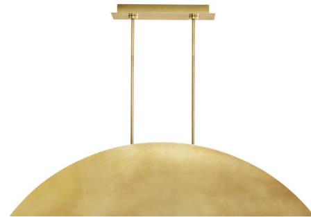
Shown in natural brass