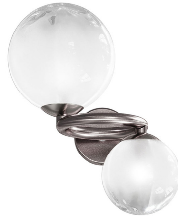
Shown in matte black nickel / white

The Puppet Ring Wall Sconce designed by Romani Sacconi Architetti Association, is a chic elegant piece that blends into a variety of room styles.