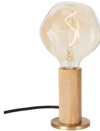
Shown in oak / tinted

The Knuckle Table Lamp combines a cylinder of FSC-certified Oak or Walnut and Satin Brass finished weighted, tilt-resistant base paired with a variety of decorative bulbs by Tala. Choose from the Sphere IV matte white bulb with Warm Dim (2000K-2800K color temperature), the Voronoi I tinted filament bulb, or the matte white 2700K Enno, Noma, Oblo, or Oval bulbs. Includes a braided PVC cord with in-line dimmer.