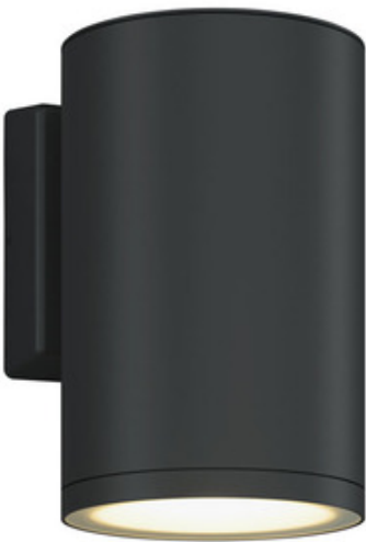
Shown in: Anthracite

The Outdoor Cylinder 6 inch LED Wall Sconce is made of extruded aluminum. Its classic cylindrical design allows for a modern look with a warm glow illuminating the wall. It can be mounted either up or down. Outdoor Cylinder includes an onboard driver. It is offered in Anthracite or Silver finish. ETL listed for wet locations.