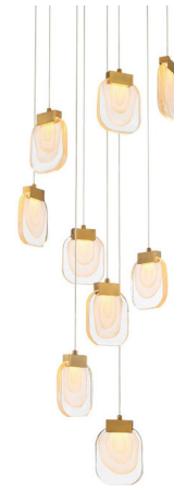
Shown in gold / clear

COLOR RENDERING . . . . . 90 CRI LAMP COLOR . . . . . 3000K LUMENS/WATT . . . . . 310.00 LUMINOUS FLUX . . . . . 1550 lumens