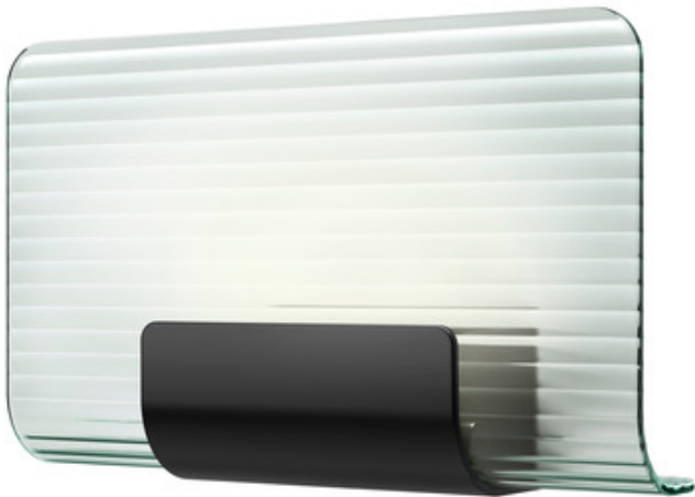
Shown in: Black / Clear

The Nami Wall Sconce's slim and sleek profile combines Aluminum with a textured Glass diffuser in order to deliver a flagship example of contemporary lighting. A base finished in Black or Brass, holds a curved piece of glass that is lightly corrugated to give the Nami depth and gently soften the emitted LED light. Place this sconce around the home in places where layered lighting is most needed. CE listed.