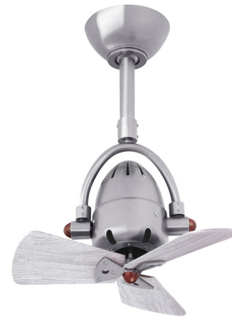
Shown in brushed nickel / barn wood tone

BLADE COLOR Barn Wood Tone BODY FINISH Brushed Nickel WATTAGE N/A DIMMER N/A DIMENSIONS 16"W x 24"H BULB N/A COUNTRY OF ORIGIN China