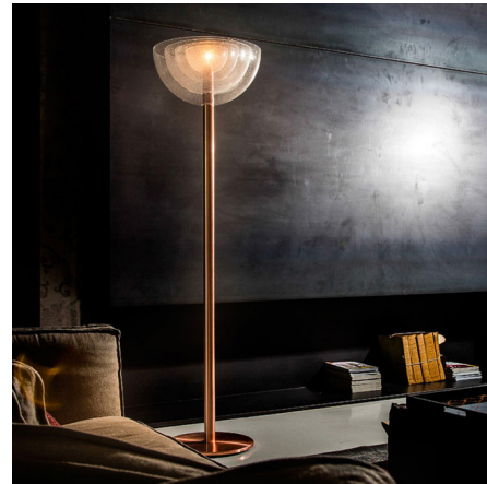
Shown in brushed copper / clear

The Nason Floor Lamp brings precise geometric forms to your interior space. The multiple domes of fogged Clear hand blown glass are stacked within each other and complemented by a Brushed Copper stem and base. In-line On/Off switch.