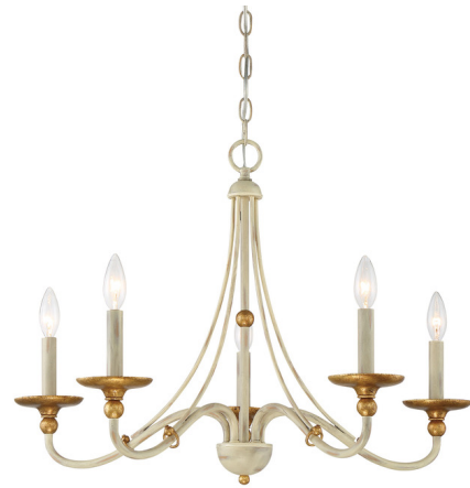
Shown in farmhouse white

PRODUCT DIMENSIONS . . . . . Chain Length: 72"