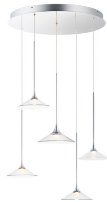
Shown in polished chrome / clear

PRODUCT DIMENSIONS . . . . . Max Overall Height: 146" LAMP LIFE . . . . . 50000 hours COLOR RENDERING . . . . . 80 CRI LAMP COLOR . . . . . 3000K LUMENS/WATT . . . . . 380.00 LUMINOUS FLUX . . . . . 1900 lumens