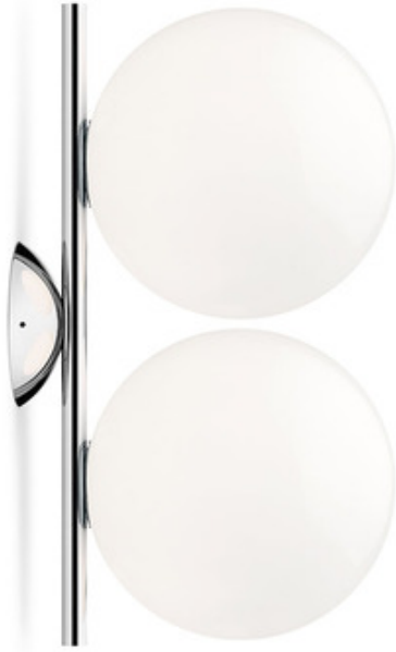
Shown in: Chrome / Opal

The IC Double Wall/Ceiling Light, designed by Michael Anastassiades, provides diffused light with two Opal glass diffuser and a Brass, Black, Red Burgundy or Chrome finish. Available in two sizes. UL listed.