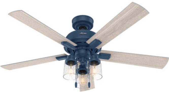
Shown in: Indigo Blue / Light Gray Oak

The Hartland Ceiling Fan with Light brings vintage charm to your space with its seeded glass shades and Edison style bulbs. Its 3-speed WhisperWind motor with SureSpeed Guarantee ensures optimal performance, quietly delivering powerful airflow to quickly create a comfortable environment. Its light kit includes three LED bulbs, providing energy-efficient ambient lighting. Pull chains are included for turning the fan on/off, adjusting speed, and turning the light on/off. Fan direction can be reversed using a switch on the fan. Optional accessories are sold separately. Note: The Matte Black finish is only available for the 52 inch diameter fan.