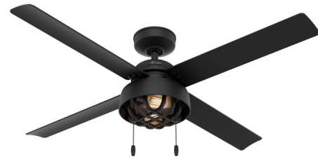
Shown in matte black / matte black