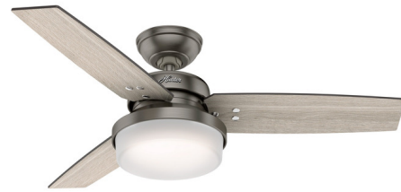
Shown in brushed slate / light gray oak / greyed walnut

The Sentinel 44 Inch Ceiling Fan has clean lines and classic finishes making it the perfect fan for casual and transitionally designed rooms. Featuring three blades set at a 13 degree pitch combined with a reversible three speed motor allowing for optimal amounts of airflow. WhisperWind technology ensures quiet performance giving you the cooling power you want without the noise. A three-position mounting system allows for standard, low, and angled mounting. Includes 3 inch and 2 inch downrod as well as a handheld remote for easy speed and lighting adjustment from anywhere in the room. Available with a Brushed Nickel motor and Light Gray Oak/ Greyed Walnut reversible blades or a Brushed Slate motor with Light Gray Oak/Greyed Walnut reversible blades. ETL listed.