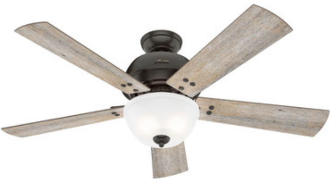
Shown in: Noble Bronze / Barn Wood

The Highdale Ceiling Fan features a rustic design that is the perfect accent for a farmhouse inspired decor. Featuring an integrated light kit and five blades at a 13 degree pitch complemented by a reversible four speed WhisperWind motor giving you the airflow you desire without the unwanted noise. Control receiver is pre-installed eliminating the need for additional wiring. Includes a handheld remote for speed and lighting adjustments from anywhere in the room, as well as a 2 inch and 4 inch downrod. A three position mounting system allows for standard, low, and angled mounting. ETL listed.