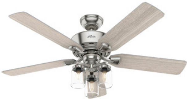
Shown in: Brushed Nickel / Light Gray Oak

The Devon Park Ceiling Fan features a rustic farmhouse and coastal design that creates an air of nostalgia in your home and is perfect for larger rooms such as Living Rooms, Bedrooms, and kitchens. Five blades are set at a 13 degree pitch and complemented by a four speed reversible WhisperWind motor that gives you the airflow you desire without the unwanted noise. A three position mounting system allows for low, standard, or angled ceilings. Available with a Brushed Nickel motor complemented by Light Gray Oak blades. Includes a 2 inch and 4 inch downrod, integrated light kit with clear glass shades that take inspiration from mason jars, as well as a handheld remote for easy speed and lighting adjustments from anywhere in the room. ETL listed.