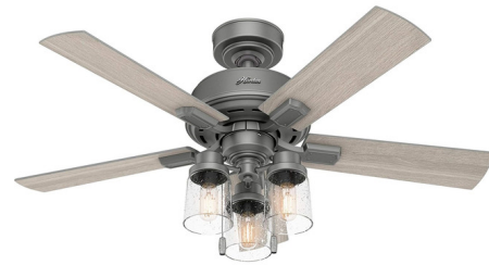
Shown in matte silver / light gray oak