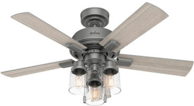
Shown in: Matte Silver / Light Gray Oak

The Hartland Ceiling Fan with Light brings vintage charm to your space with its seeded glass shades and Edison style bulbs. Its 3-speed WhisperWind motor with SureSpeed Guarantee ensures optimal performance, quietly delivering powerful airflow to quickly create a comfortable environment. Its light kit includes three LED bulbs, providing energy-efficient ambient lighting. Pull chains are included for turning the fan on/off, adjusting speed, and turning the light on/off. Fan direction can be reversed using a switch on the fan. Optional accessories are sold separately. Note: The Matte Black finish is only available for the 52 inch diameter fan.