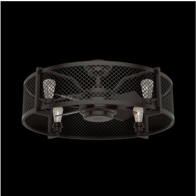
Shown in: Noble Bronze / Noble Bronze

The Fennec Ceiling Fan features a unique cage design making it perfect for rooms with an industrial or farmhouse design scheme. Four blades are set at a 16 degree pitch and complemented by a three speed reversible WhisperWind motor that gives you the airflow you desire without the unwanted noise. A three position mounting system allows for mounting on low, standard, or angled ceilings. Available with a Noble Bronze finish and matching blades. Includes a 4.5 inch downrod, integrated light kit, as well as a Wall Control for easy speed and lighting adjustments. ETL listed.