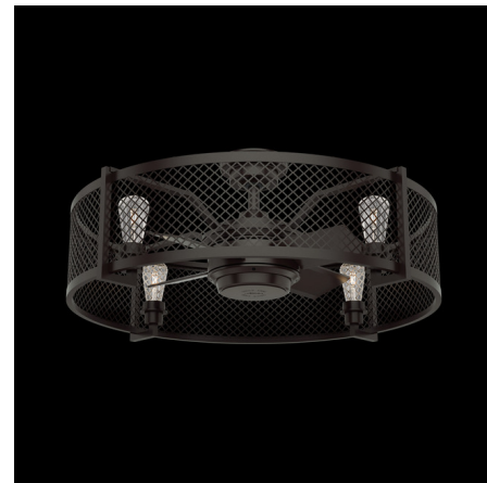
Shown in noble bronze / noble bronze

The Fennec Ceiling Fan features a unique cage design making it perfect for rooms with an industrial or farmhouse design scheme. Four blades are set at a 16 degree pitch and complemented by a three speed reversible WhisperWind motor that gives you the airflow you desire without the unwanted noise. A three position mounting system allows for mounting on low, standard, or angled ceilings. Available with a Noble Bronze finish and matching blades. Includes a 4.5 inch downrod, integrated light kit, as well as a Wall Control for easy speed and lighting adjustments. ETL listed.