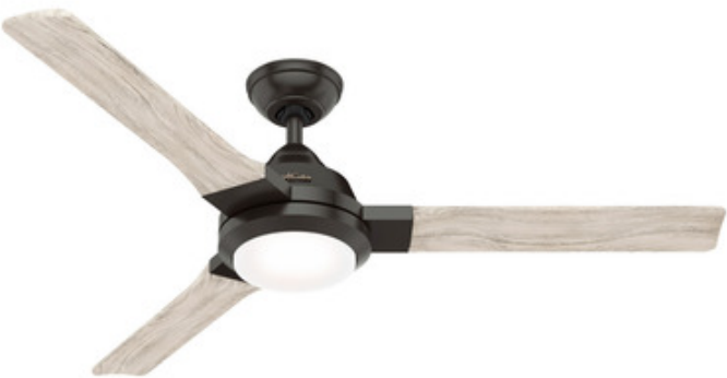
Shown in: Noble Bronze / Weathered White Birch

The Leti Ceiling Fan features carved wood blades and a captured blade design that has a chameleon effect allowing it to take on the style of any room and enhance the look. Three blades set at a 12 degree pitch combined with a three speed reversible WhisperWind motor gives you the airflow you desire without the unwanted noise. Includes a wall control for easy speed and lighting adjustments as well as a 4.5 inch downrod and integrated light kit. A three point mounting system allows for standard, low, and angled mounting. ETL listed.