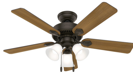
Shown in new bronze / american walnut / greyed walnut / clear frosted

COLOR RENDERING . . . . . 80 CRI LAMP COLOR . . . . . 3000K LUMENS/WATT . . . . . 276.92 LUMINOUS FLUX . . . . . 1800 lumens