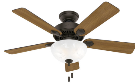
Shown in new bronze / american walnut / greyed walnut / swirled marble