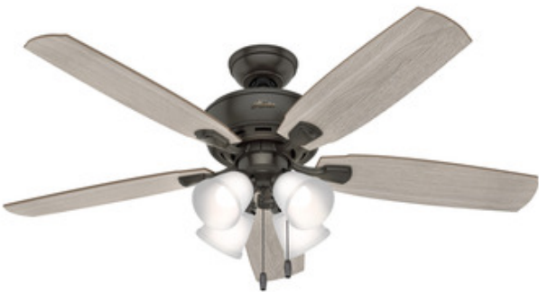
Shown in: Noble Bronze / Light Gray Oak/American Walnut

The Amberlin Ceiling Fan is a traditional ceiling fan with a light making it a great fit in most casual and transitional spaces. Featuring five blades set at a 13 degree pitch and combined with a reversible three speed WhisperWind motor providing ample amounts of airflow without the noise. Includes a pull chain for quick and easy on/off as well as speed adjustments. A three position mounting system allows for standard, low, and angled mounting. Includes a 2 inch and three inch downrod. Available in a Fresh White motor with Fresh White/Bleached Grey Pine reversible blades, Brushed Nickel motor with Greyed Walnut/Autumn Walnut reversible blades, or a Noble Bronze motor with Light Gray Oak/American Walnut reversible blades. ETL listed.