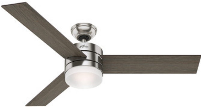
Shown in: Brushed Nickel / Light Gray Oak / Greyed Walnut

The Exeter Ceiling Fan has a playful take on geometric shapes featuring rectilinear blades embedded in the round housing. Perfect for modern interior design spaces due to the simple and modern form of the fan. Three blades at a 13 degree pitch combined with a three speed reversible WhisperWind motor gives you the airflow you desire without the noise. Includes a handheld remote for easy speed and lighting adjustment from anywhere in the room as well as a 2 inch and 4 inch downrod. The three point mounting system allows for standard, low, and angled mounting. Available with a Brushed Nickel motor and Light Gray Oak / Greyed Walnut reversible blades or a Fresh White motor and Fresh White / Bleached Oak reversible blades. ETL listed.