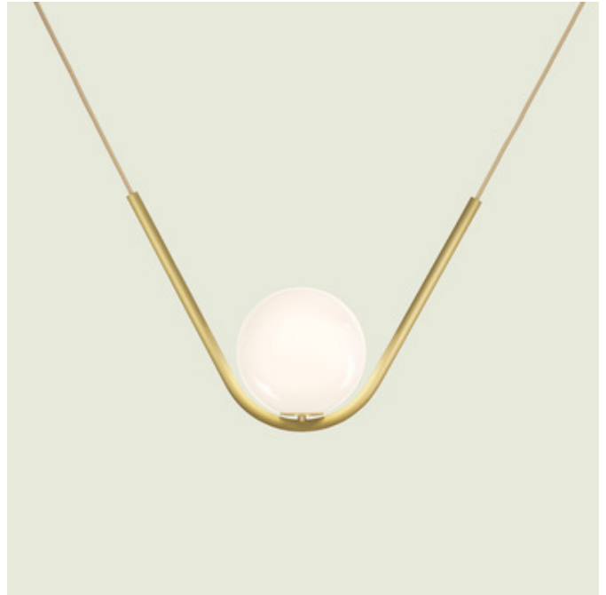
Shown in: Aged Brass / Alabaster White

The Perle 1 Pendant takes inspiration from the romantic world of jewelry. A handcrafted, delicate metallic structure houses an 8 inch hand-blown glass ball to symbolize a Pearl. Place this stunning beauty in single or multiples over the dining table to complete your interior's contemporary aesthetic. Made in Canada. Available with a center or off-center canopy option.