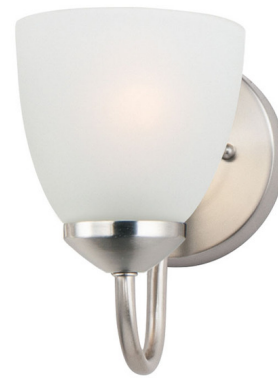
Shown in satin nickel / frosted

The transitional design in the Axis Wall Light works in any style home. Full length oval backplates support simple bell-shaped, Frosted glass shades. Can be mounted up or down.