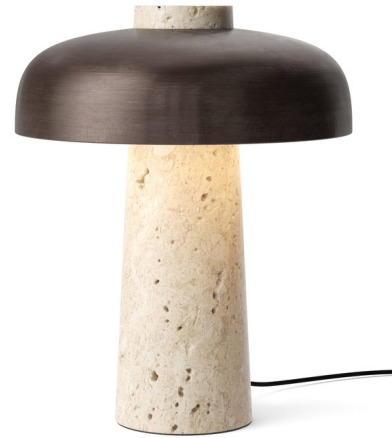
Shown in travertine / bronzed brass

PRODUCT DIMENSIONS . . . . . Cord Length: 78.7" COLOR RENDERING . . . . . 85 CRI LAMP COLOR . . . . . 3000K Warm Dim LUMENS/WATT . . . . . 93.33 LUMINOUS FLUX . . . . . 560 lumens