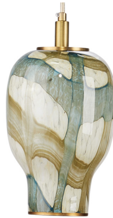
Shown in antique brass / pale blue glass

The Helen Pendant was inspired by abstract artists in the 40s and 50s who used a style of painting that included watercolor brushes and wide strokes. Available in two sizes with a Pale Blue Glass shade complemented by an Antique Brass finish. Includes champagne cloth cord and a 5.5 inch canopy. UL listed.