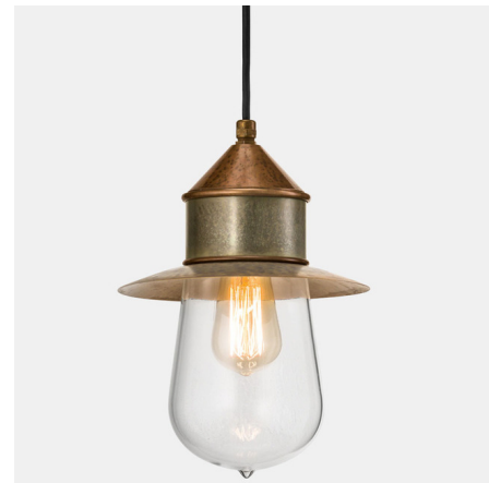
Shown in brass / clear

The Drop I Pendant with Rim brings an industrial vibe through its craftsmanship and materials. Constructed of Copper and Brass, the Drop's look is capped off with a clear Glass shade that adds an extra layer of tension to the piece. Classic and contemporary, the Drop works well in a number of interiors. Includes canopy for US installation. UL listed.