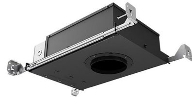
Shown in galvanized steel