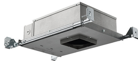
Shown in galvanized steel