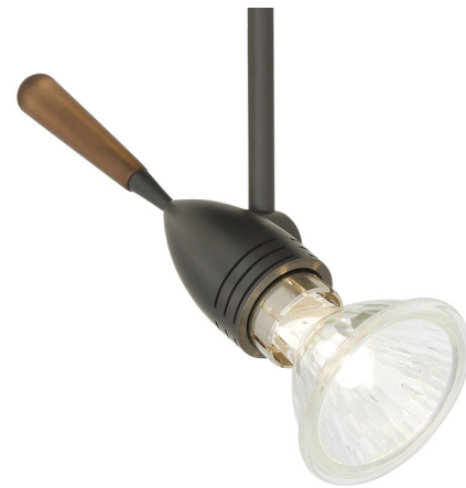
Shown in antique bronze

The Aero Freejack Head is a sleek, streamlined head which rotates 360 degrees and pivots 260 degrees to direct the beam. Available in three stem lengths. The removable handle extension on the back serves as a functional addition assisting with pivots and rotations. Shade accessories allow you to create the ideal custom element. Compatible for use with 1-circuit Monorail track system, Wall Monorail or Freejack canopy. Includes Freejack connector. Freejack canopy required if used as a monopoint, sold separately. LED canopy compatible with both halogen and LED lamp options. Dimmer type dependent on system transformer (low voltage magnetic or electronic). Note: A shade accessory is required, and sold separately.