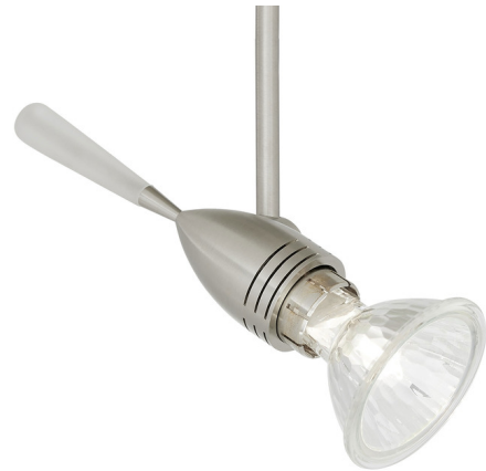
Shown in satin nickel

The Aero Freejack Head is a sleek, streamlined head which rotates 360 degrees and pivots 260 degrees to direct the beam. Available in three stem lengths. The removable handle extension on the back serves as a functional addition assisting with pivots and rotations. Shade accessories allow you to create the ideal custom element. Compatible for use with 1-circuit Monorail track system, Wall Monorail or Freejack canopy. Includes Freejack connector. Freejack canopy required if used as a monopoint, sold separately. LED canopy compatible with both halogen and LED lamp options. Dimmer type dependent on system transformer (low voltage magnetic or electronic). Note: A shade accessory is required, and sold separately.