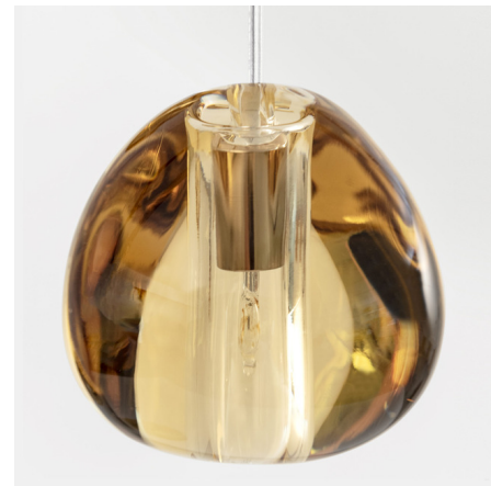
Shown in white / champagne

The Mizu pendant, designed by Nicolas Terzani, is a hand-made artistic light inspired by tranquil and mesmerizing light refractions created by water. Like water droplets, no two Mizu fixtures are alike. Each crystal shape is unique. Mizu is made from 24 percent lead, the clearest crystal, and perfectly emulates water's refraction of light creating amazing patterns around a room.