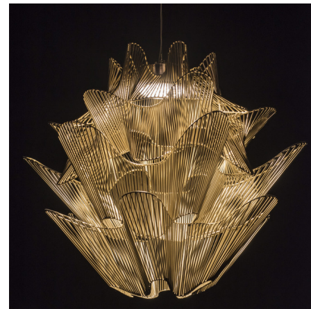
Shown in gold

The Moire Pendant gets its name from the French term derived from silk with a rippled or watered appearance, an optical effect that results in the illusion of waves or the movement of water. This effect is achieved by having a ruled pattern overlaid over another. Available in Gold plated or Nickel. ETL listed.