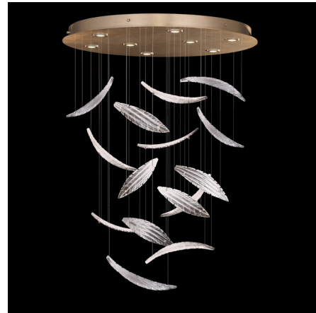
Shown in gold leaf / crystal white

The Elevate Plume Round Pendant raises your room to new heights with its shimmering feathers that reflect light and shadows across your space. Each Plume is hand blown and sculpted with a translucent mixture to create Crystal White or Crystal Dichroic. Not suitable for vaulted ceilings.