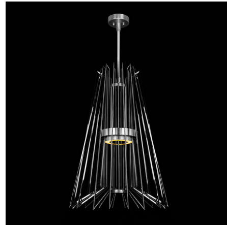
Shown in silver leaf / crystal

The Newton Spider Pendant presents a sculpture of crystal and light, offering sparkle at every angle. An array of Crystal panels seem to float around a central frame. Canopy: 6 inch diameter. Available in Uplight or Downlight options. NOTE: Not suitable for sloped/vaulted ceilings.