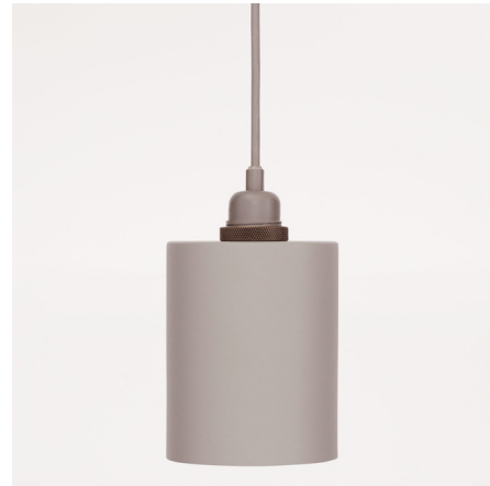
Shown in gray

The Geometric Cylinder Pendant provides a strong character, with the underlying geometric simplicity of a cylindrical shape. A smooth and sleek die cast aluminum cylinder acts as the pendant's main visual focus, and provides a polished sophistication to the luminaire. Available in three sizes. CE listed.