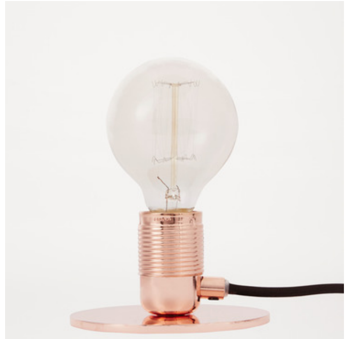
Shown in: Copper

The E27 Table Lamp is an industrial and straight forward fitting combined with a textile cord. Best combined with various decorative bulbs. Place around the home to illuminate your space. On/off switch located on the lamp's cord. CE listed.