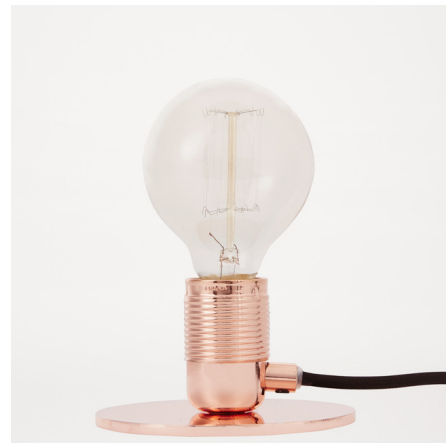
Shown in copper

The E27 Table Lamp is an industrial and straight forward fitting combined with a textile cord. Best combined with various decorative bulbs. Place around the home to illuminate your space. On/off switch located on the lamp's cord. CE listed.