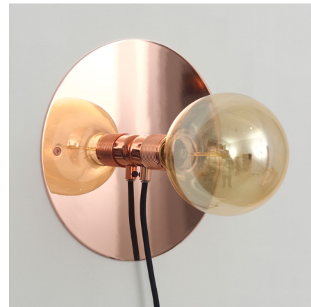
Shown in copper

The E27 Wall Sconce is an industrial and straight forward fitting combined with a textile cord. Best combined with various decorative bulbs. Place around the home to illuminate your space. On/off switch located on the lamp's cord. Finished in Copper, Brass or Bronze. CE listed. NOTE: Small size only available in Copper.