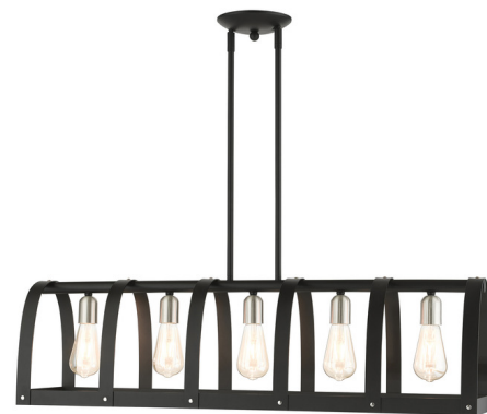
Shown in textured black

PRODUCT DIMENSIONS . . . . . Adjustable Overall Height: 17" to 54.75"