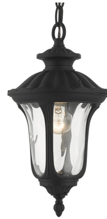
Shown in textured black / clear

Introduce vintage charm into your outdoor space with this Oxford Pendant which features an antique-style lantern design and clear, textured water glass. Suitable for covered outdoor spaces. Note: Textured White finish is not available in all sizes.