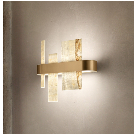
Shown in matte gold / onyx

The Honice Wall Sconce features rectangular pieces of natural onyx diffusers of different sizes attached to a flat metal band that curves towards the wall. The metal structure has an opaque gold finish. Choose between a small and medium size sconce. ETL listed.