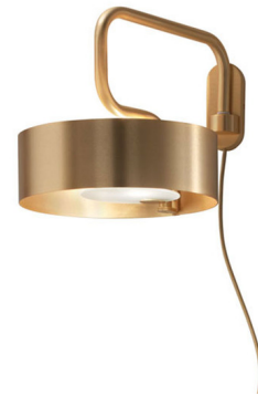
Shown in brushed gold / diffused lens

The Sound Wall Sconce features a circular metal band that wraps around a smaller round diffused lens. It is connected to the wall by an elegantly curved metal rod. Choose between a Brushed Gold finish or a combination of Matte Black and Brushed Brass finish. This fixture comes with a cord but it can also be hardwired into the wall. Available with halogen or LED lamp options. ETL listed.