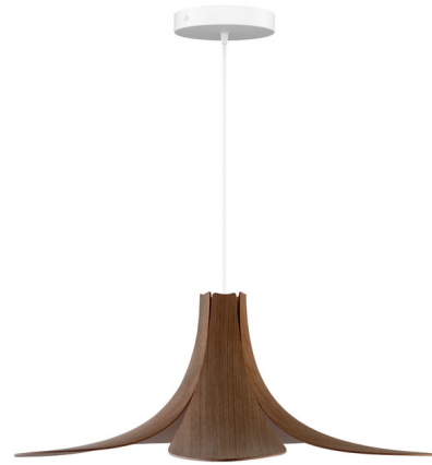
Shown in white / dark oak

The Jazz Pendant, designed in Denmark by Magnus Nero and Ingemar Jonsson, is inspired by the flowing lines of the frangipani flower and the classic gramophone horn. Crafted from veneer, this piece is perfect in a variety of interior spaces. Plug in option includes shade, socket assembly, 10 foot cord and plug.