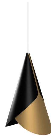
Shown in white / black / brass

PRODUCT DIMENSIONS . . . . . Adjustable Max Height: 120"