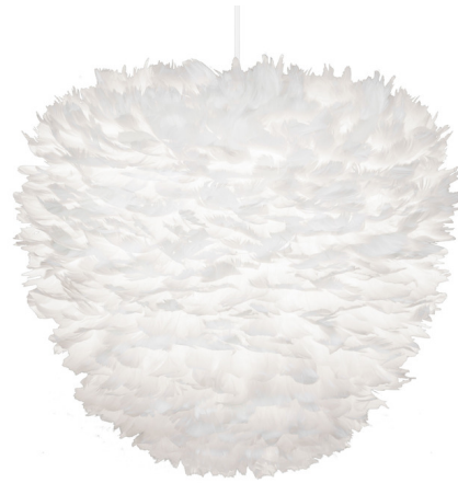
Shown in white / white

The Eos Evia Pendant draws its inspiration from nature's beehives. This piece will be the center of attention in your room with its unique combination of shape and materials. Made from authentic goose feathers, each carefully positioned on a paper core by hand. It radiates a cozy and pleasant glow. Routine cleaning is easily done with a hairdryer. Small size has 2340 feathers and large size has 4500 feathers. UL listed.