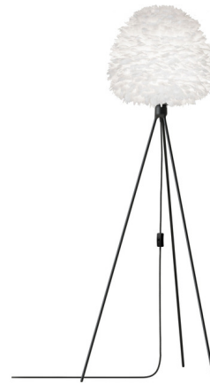
Shown in black / white